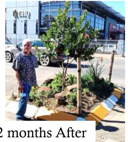
Before & 12 months After